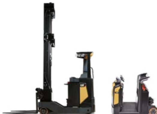
Multi-Way Reach Trucks: 2.0 & 2.5 tonne capacity