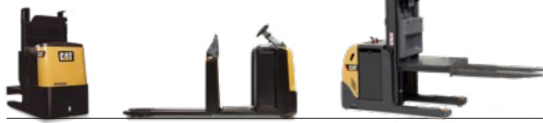
Order Pickers: 1.0 – 2.5 tonne capacity