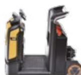
Tow Truck: 3.0 tonne capacity