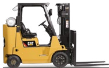
LP Gas Cushion range: 3.5 – 7.0 tonne capacity