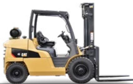
LP Gas / Petrol range: 1.5 – 5.5 tonne capacity