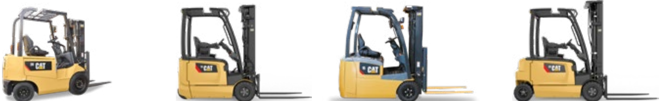
Electric range: 1.0 – 5.0 tonne capacity