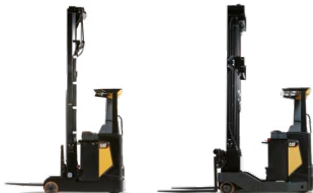
Reach Truck range: 1.4 – 2.5 tonne capacity