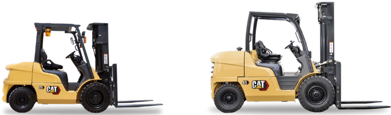
Diesel range: 1.5 – 16.0 tonne capacity