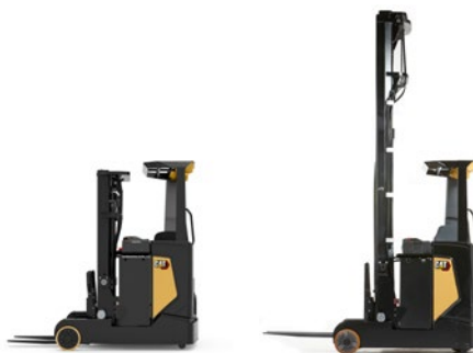
Reach Trucks: 1.2 – 2.5 tonne capacity