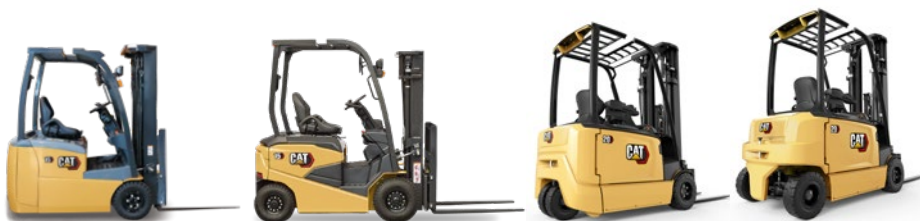
Electric range: 1.0 – 5.5 tonne capacity

We have everything from compact 48V 3 and 4 wheel workhorses to heavy duty 80V units. Today's Cat electrics blend refinement with high strength and durability for demanding applications and conditions. Each truck is fully programmable to meet the needs of its driver and task perfectly.