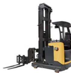
Man-Down VNA Trucks: 1.3 – 1.5 tonne capacity