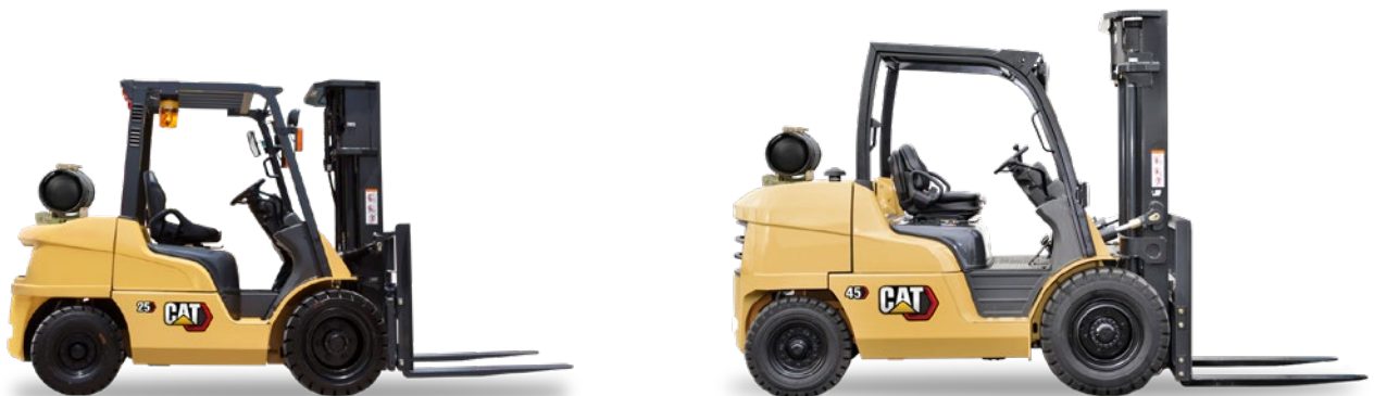
LP Gas range: 1.5 – 5.5 tonne capacity