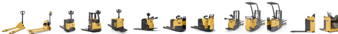
Hand / Power Pallet Trucks: 1.2 – 2.5 tonne capacity