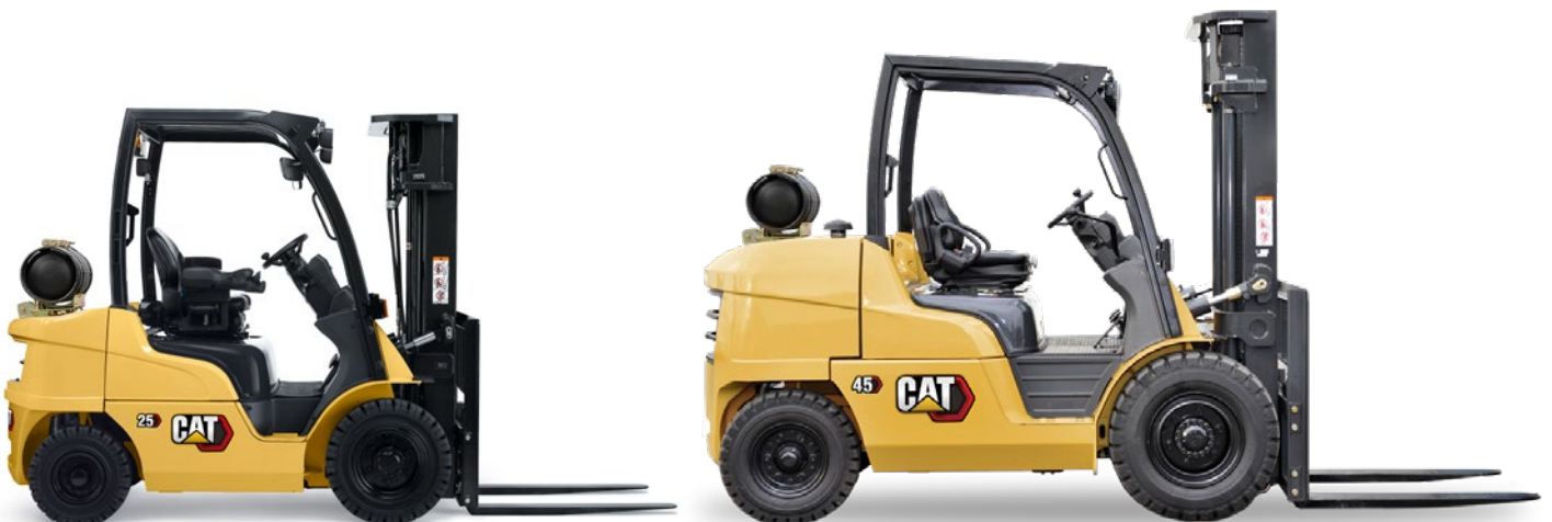
LP Gas range: 1.5 – 5.5 tonne capacity