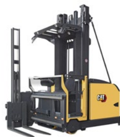
Man-Up Turret Trucks: 1.1 – 2.0 tonne capacity