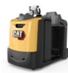
Tow Trucks: 3.0 – 5.0 tonne capacity