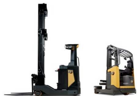
Multi-Way / 4-Way Reach Trucks: 2.0 – 2.5 tonne capacity