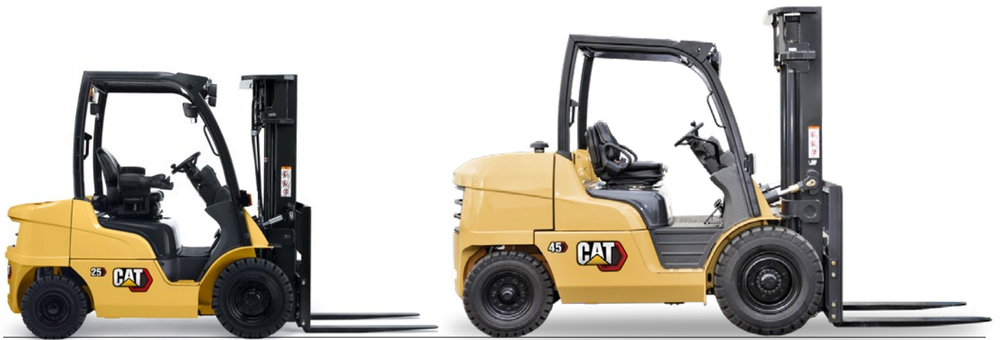
Diesel range: 2.0 – 10.0 tonne capacity