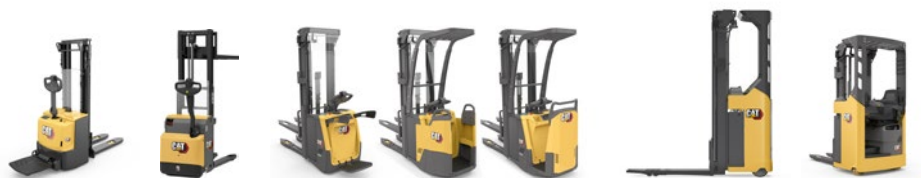
Stackers: 1.0 – 2.0 tonne capacity