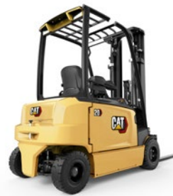
Electric range: 1.4 – 5.5 tonne capacity