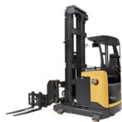
Man-Down VNA Trucks: 1.3 – 1.5 tonne capacity